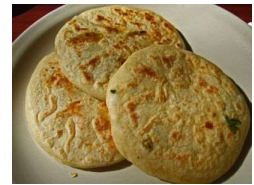
Emely's favorite food is papusas!