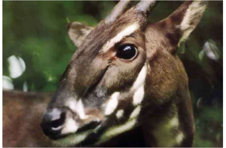
Saolas are often called "the Asian unicorn."

The average size of a saola is about five feet. Their horns can reach up to a length of three inches. They are considered to be a critically